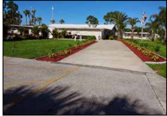
Trinette Arboricola: THEN 2014